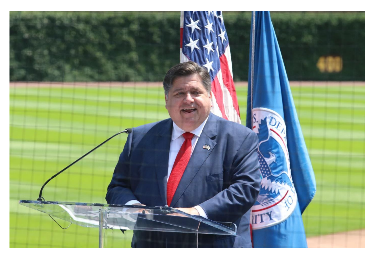
Above: Governor Pritzker; Below: Chief Judge Pallmeyer